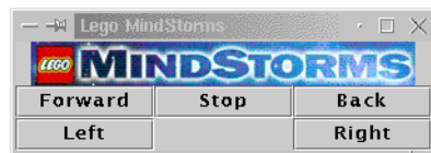
Figure 19-3. User interface for MindStorms car

I have been using an RCX car. While it can do lots of things, it has been convenient to use five commands for demonstrations: forward, stop, back, left, and right, with a user interface as shown in Figure 19-3.